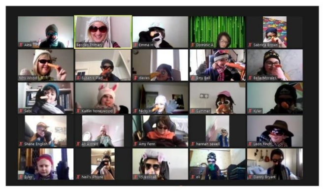
Year 5 Magnetite Zoom!